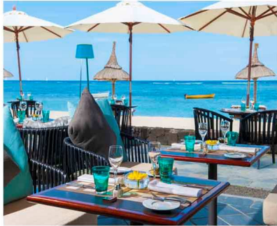
Tamassa Beach Restaurant

Up to 300 Persons Meeting Rooms Capacity